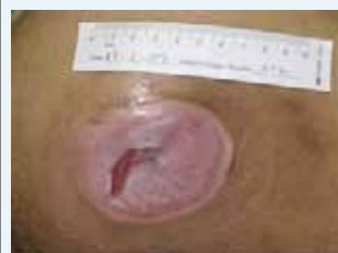
Fig 2: Improvement in the wound after seven months